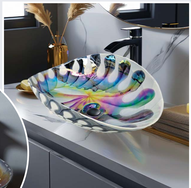
ABOVE: Ruvati's Murano glass seashell vessel in Spira Luxe Pearl White