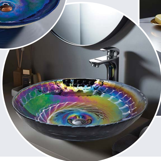
RIGHT: Ruvati's Murano glass circle vessel in Cosmic Black

Murano is to glass what caviar is to food. The mere mention of the name instantly denotes legacy, pedigree, and superior artistry. Ruvati's new Murano Collection of hand-blown glass sinks certainly lives up to that description. The new line offers two styles: a sleek circular basin and a seashell design in vivid colors of blue, green, brown, or black with a glossy finish that make them ideal choices for a standout powder room. ruvati.com