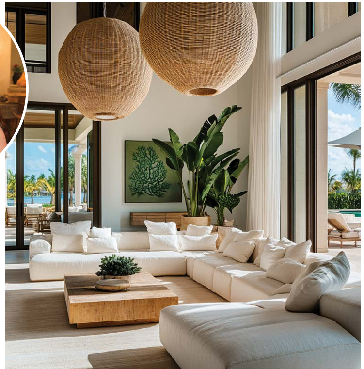
ABOVE AND FAR LEFT: At Faro's inventory advocates the sustainable and handmade, as well as biophilic connection.